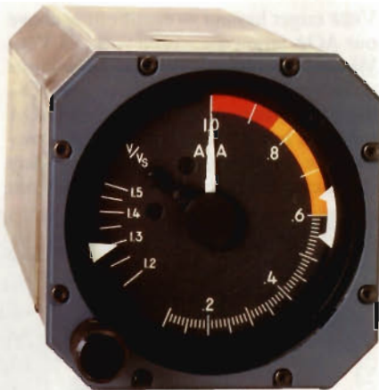
Angle of attack indicators are usually calibrated in units between zero and one with 1.0 equal to a stall. Typically, an AOA of 0.8 will trip the stall warning or stick shaker. An indication of 0.6 approximates 1.3 V so (typical V REF ). Often the background between 0.6 and 0.8 is shown as yellow to indicate operating configurations that require caution. Best LD is usually found near 0.5. The indicator to the left has a bug that can be set for V/Vs.

Certain long-distance pilots — sometimes lacking much else to do — pay a